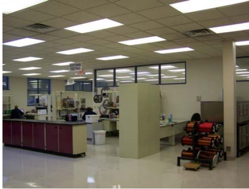
Electrical Insulation Systems Laboratory

So do you need EIS testing? The most important question to ask is this; "Do I need to know the maximum thermal class application rating for this system (Group of EIM's)?"